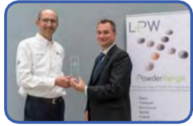
Carpenter Additive £17m investment in additives powder plant