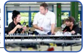
Rockford Components 60% sales increase plus 100 jobs