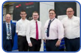
Hyde Aero Products 50% productivity increase plus 60 jobs