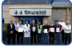
JJ Churchill Ltd £70m contract win