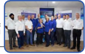
Amphenol Invotec Record sales and increased exports