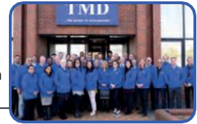
TMD Technologies 64% gain in productivity