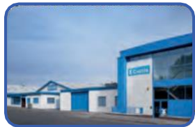
Castle Precision Engineering Record £80m order