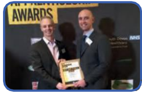
G&H Ilminster 75% sales growth plus 100 jobs